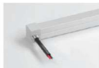
Side Cable Entry: The cable could be perfectly hidden to achieve seamless light connection.