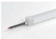
Front Cable Entry: The cable could be hidden in all directions by the flexible design.