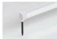
Bottom Cable Entry: The cable could be perfectly hidden to achieve seamless light connection.