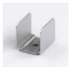
Stainless Steel Clip