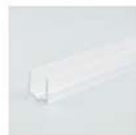
Transparent PC profile